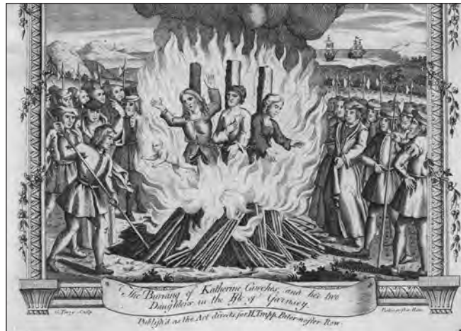
[Punishment in the 16 th century]