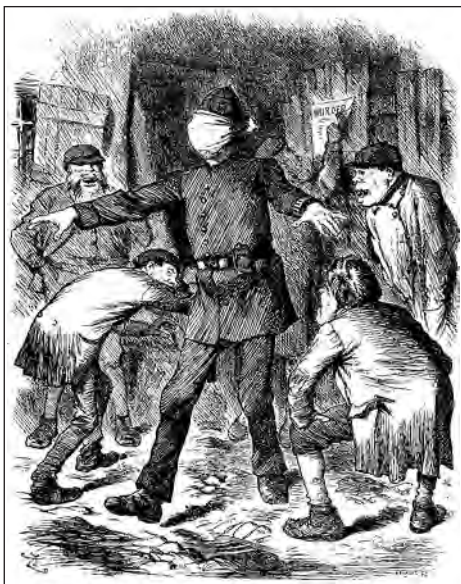
[A cartoon entitled Blind Man's Buff showing the inability of the police to catch Jack the Ripper. It was published in the satirical magazine Punch in September 1888]